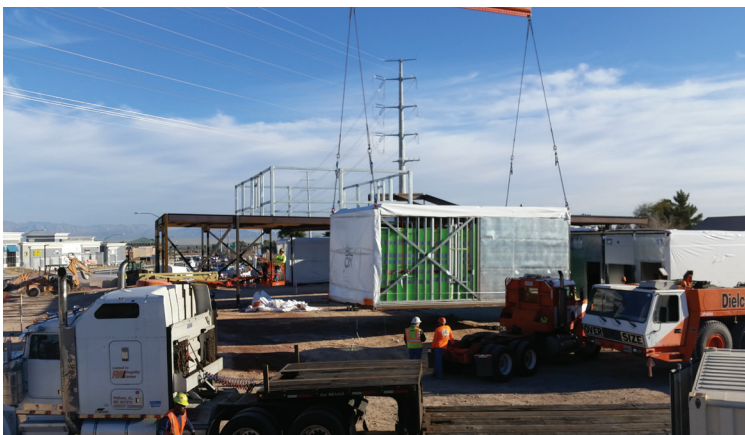
Photo of BLOX construction site

“ We were looking for a cost-effective construction camera solution for our fast-moving projects. We need to have cameras monitoring our projects from start to finish. From the production lines in our factory in Bessemer, AL to the numerous construction sites spread throughout the country, our team has the ability to monitor a project's progress in real-time even when we aren't on-site. ”