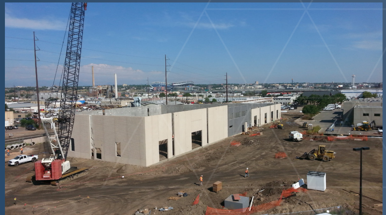
Photo of Denver Water development site